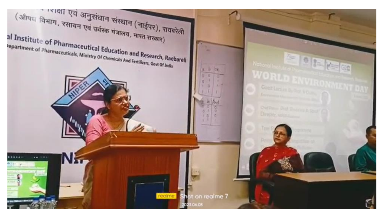
A key inaugural message by the Director, NIPER Raebareli

All faculty, staff, and students attended the event.