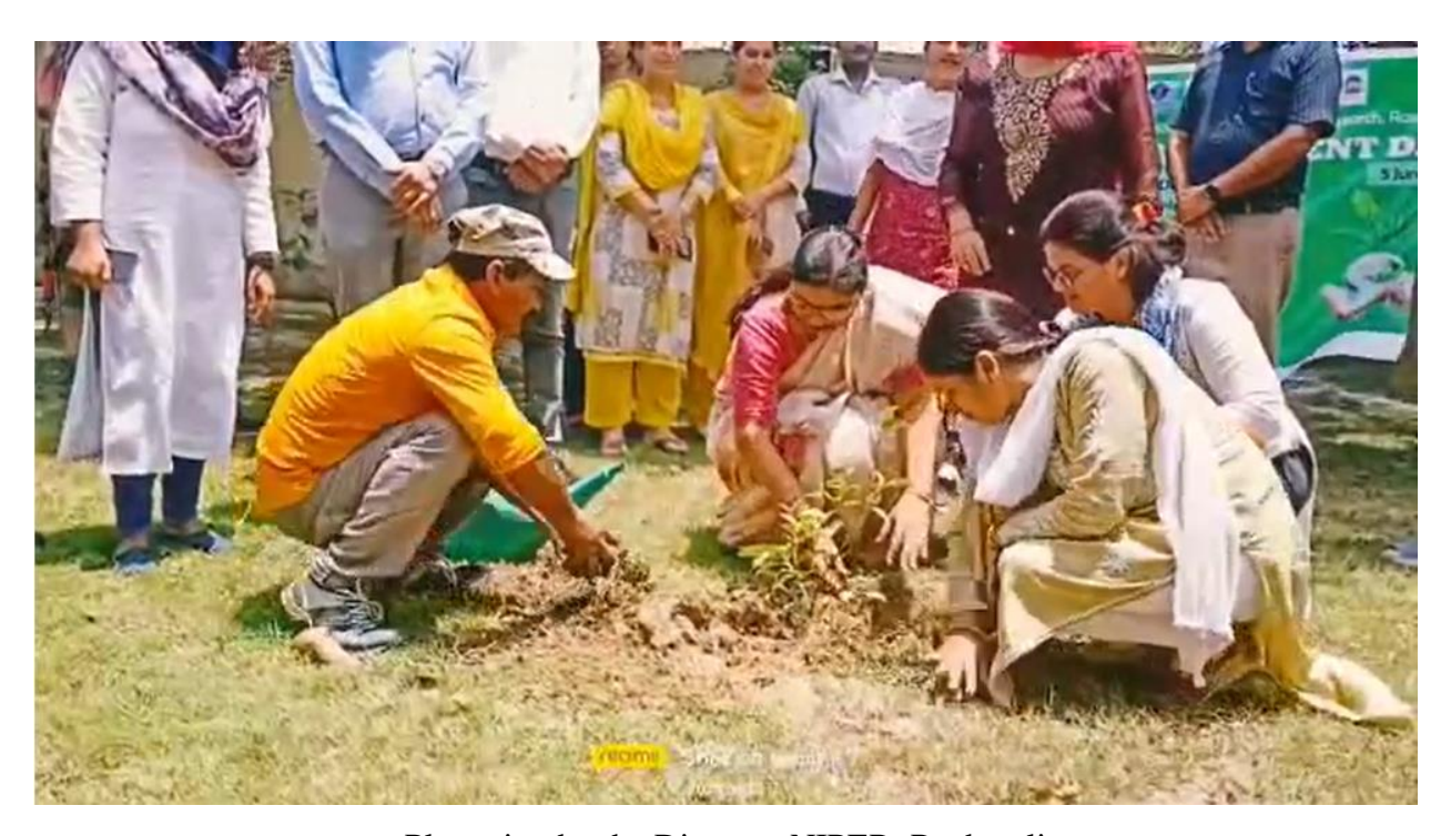
Plantation by the Director, NIPER, Raebareli

A plantation drive was also conducted by the Director, Registrar, Dean, Faculty members, staff, and students on the institute's campus.